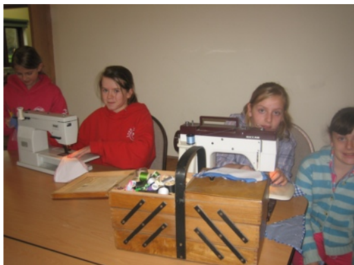
YOUNG LADIES OF HAWSTEAD MAKING BUNTING FOR THE JUBILEE CELEBRATIONS

The AGM will be in May. Date to be decided at our next meeting on the 16th April.