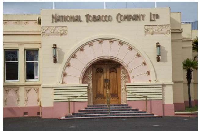
ART DECO BUILDING - NAPIER