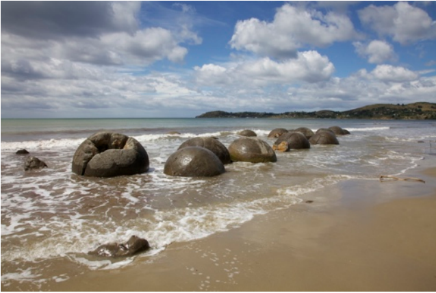
MOERAKI BOULDERS AT HAMPDEN BEACH