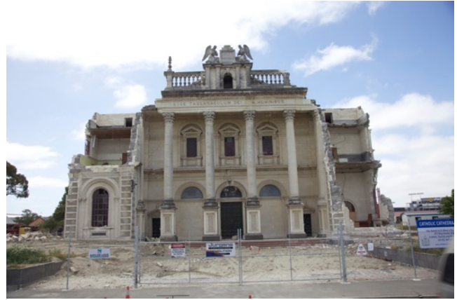
EARTHQUAKE DAMAGE = CHRISTCHURCH