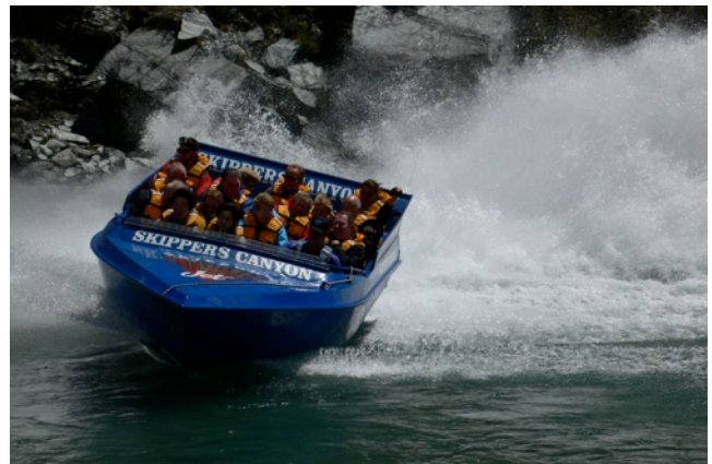
JET BOAT ON SHOTOVER RIVER