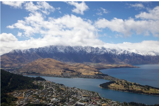
THE REMARKABLES QUEENSTOWN