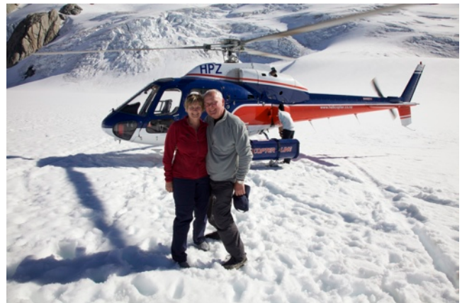
MOUNT COOK BY HELICOPTER