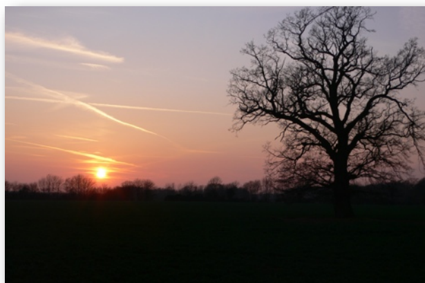
SUNSET OVER PINFORD END MARCH 2012

Breakthrough Charity Walk at Hawkedon 17th March (10am) Parish Council Meeting 29th March (7:30pm) Community Council 16th April (7:30pm) Parish Council Coffee Morning Date TBA (10:30 - 12:00) Easter Fayre Monday 9th April Diamond Jubilee 2nd June Village Fete 5th August