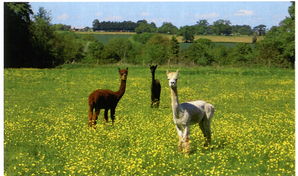
Our Alpacas enjoying the sun in Church Road